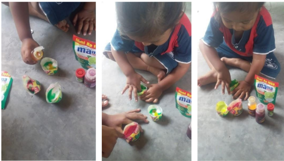
Figure 4. How to Process Finger Painting Dough

IF1 emphasizes that this motivation is encouraged to develop their imagination and creativity further so that students are indirectly trained in fine motor skills.