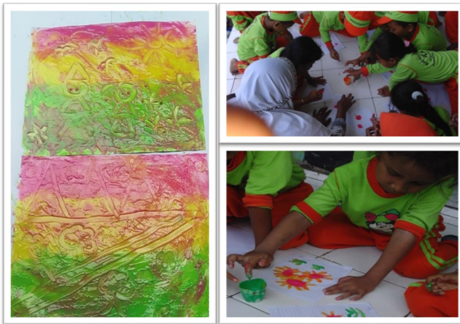
Figure 5. RA Maysitoh VI's Finger Painting Activities

IF2 also emphasized that in making painting patterns on blank paper, the teacher first explained the themes learned on that day, for example; the music of the universe sub-theme of natural objects, then students are directed to paint finger painting according to the theme explained by the teacher, but the teacher does not charge the child to follow the directions the teacher gives, enough that the child wants to move his hand to paint using finger painting, it is more than enough to stimulate fine motor skills.