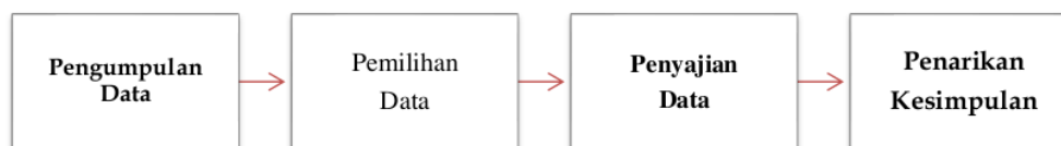
Figure 1. Stages of the Data Collection Process

Sources of informants were obtained from school principals, teachers, parents, and students of RA Maysitoh VI. Furthermore, observations were made in four meetings to directly observe finger painting activities to improve the physical development of fine motor skills in children. The latter analyzes documents that can corroborate the research results. The data relating to the research were collected, then the data was selected, followed by the presentation of the research data, and the final stage was drawing conclusions. The researcher can analyze and conclude the research conducted through the steps carried out. The research design is illustrated by the chart in Figure 1.