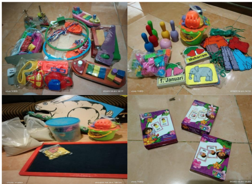
Figure 4. Educational Game Tool RA Nurus Greetings Sensory Motor Support

Figure 4 shows the educational game tools used by RA Nurus Salam in supporting and training children's concentration through sensory-motor activities.