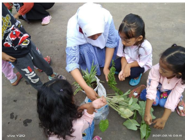
Figure 5. Planting Activities Playing With Nature

Figure 5 shows RA Nurus Salam's students mingling with nature in flower planting activities involving their sensory motors.