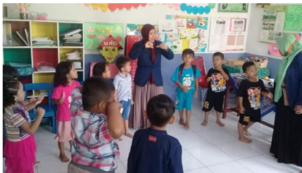
Figure 3 shows that clapping activities accompanied by musical rhythms can train children's sensory motors and increase children's concentration and focus on learning guided by educators or teachers.

Also conveyed by IF2 teacher RA Nurus Salam, sensory-motor activities carried out through audiovisual media at RA Nurus Salam such as sports activities, gymnastics, vehicle movements, animal movements, clapping movements accompanied by songs, and others. Figure 1 shows that clapping activities accompanied by musical rhythms can train children's sensory motors and increase children's concentration and focus on learning guided by educators or teachers (Figure 3).