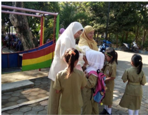
Picture 3 The teacher waits and welcomes students' arrival in front of the school gate.

Sometimes, grade A children still whine and don't want to be left by their parents. If something like this happens, the teacher will advise the child, hold his hand, and invite the child to chat about things that interest him for a while. At the same time, other teachers will ask parents to leave the child when the child's attention has been distracted. Thus, this activity also requires collaboration between teachers to achieve the program goals to be completed. In addition, teacher discipline is another supporting factor because teachers must arrive before 07.30 WIB to wait and welcome the arrival of their students.