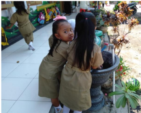
Figure 5 Children learn to wash their own hands.

correctly and adequately (I. Hasanah et al., 2019). Not only that, the activity of washing their own hands can train children's initiative in doing something (Danauwiyah & Dimiyati, 2021).