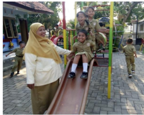
Figure 4 The teacher accompanies the students to play.

In Figure 3 above, you can see the activities of the teacher who is waiting for his students to come and teach him to shake hands. As previously explained, this activity aims to welcome children to feel happy, and children's attention to parents is diverted. However, some parents still insist on accompanying their children into the school building. To prevent this from happening, the Sinar Harapan Kindergarten teacher will urge parents who are still in the school environment to leave the school immediately and lock the school gates.