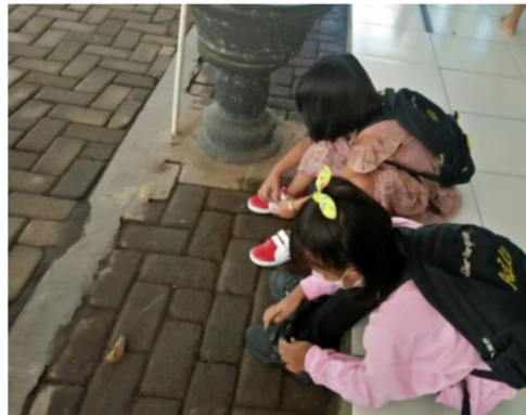
Figure 6 Students putting on their shoes

Fourth , tidy up school supplies and put on their shoes. The main objective of this activity is for children to get used to maintaining, caring for, and using their belongings properly without the help of adults. This activity also teaches children to be responsible for their belongings. The teacher will occasionally direct students who are often impatient when putting on shoes. Therefore, to support this activity, the teacher also urges students' parents to provide shoes without laces so that children do not have trouble putting on their shoes.