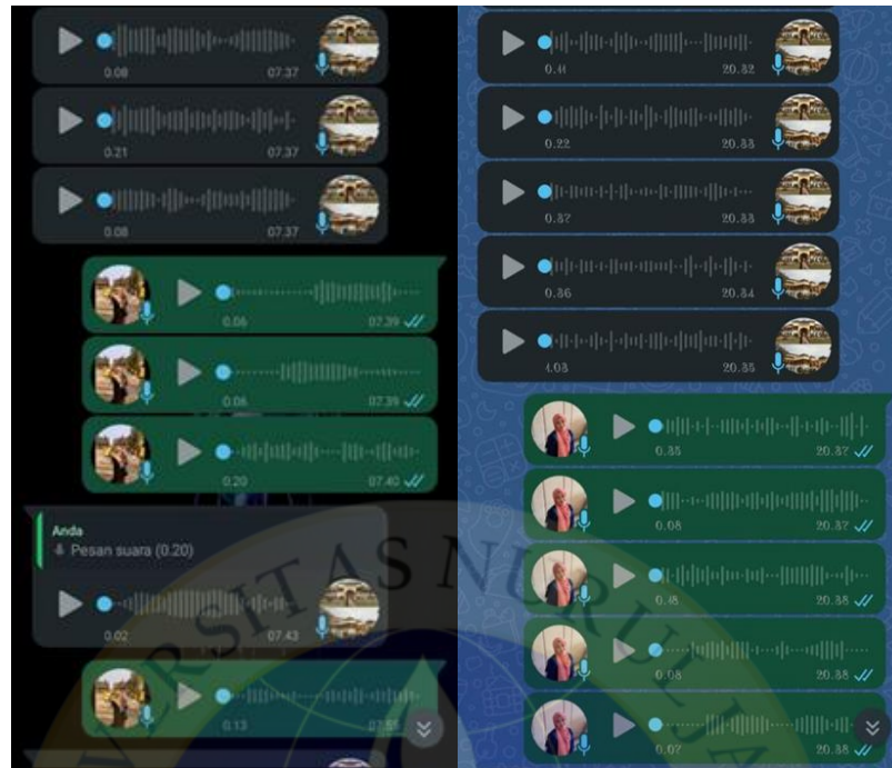
Figure 1: Documentation of The Interview