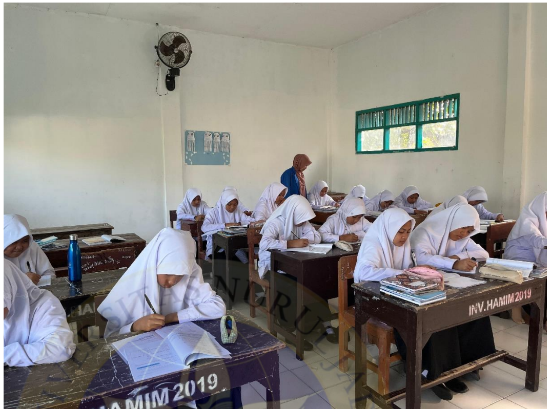
Gambar observasi di kelas