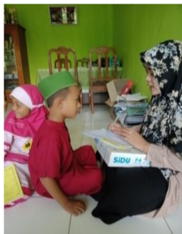
Figure 3. The teacher reads and the child pays attention to the pronunciation of the letters

With the wahdah method, the child feels very long in memorizing because he has to repeat it many times until he really memorizes it before finally moving on to the next letter or verse. Especially for early childhood, it will take a lot of time to apply the wahdah method. Because they have to adjust their time when playing and when memorizing.