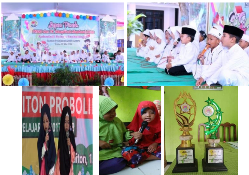
Figure 4. Evaluation of tahfidz Quran children in various activities

In the form of an external evaluation, the school routinely sends students to participate in local and long-distance MTQ and MHQ competitions. Some students were able to win the competition to read and memorize short letters (interview with Ulin Baenana Guru Hafidz TK Masyitoh). Evaluation of tahfidz Quran children in various activities can be seen on figure 4.