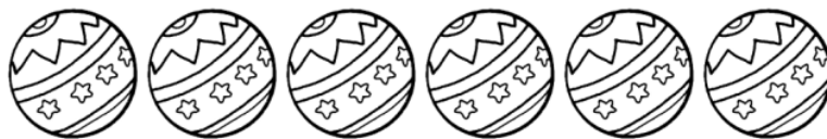
Figure 3. Shows an example of a colorless ball.

Some children focus too much on coloring and overlook the computation results when presented with a colorless picture like the one above, but this does not lower each child's concentration. The other child must insist on picking the color. This occurs when the teacher is too preoccupied with implementing the lesson plans to notice each child's condition. Because the teacher is less responsive and attentive, there is also a gap between the teacher and the child. Teachers must act as collaborators, mentors, and parents to their students. Other tactics, on the other hand, can eventually overcome this.