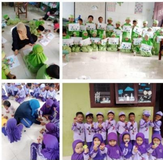
Figure 2. shows the naturalist illustration drawing method's process of learning. (documentation of researchers in the field)

Teachers, as educators, must take an active role in implementing learning models to assist pupils in focusing on their studies. This will have an impact on student learning outcomes. As a result, visual media usage in the classroom improves children's concentration. There are various factors to consider while choosing picture media, including each student's personality, the features of the material, and the child's learning environment.