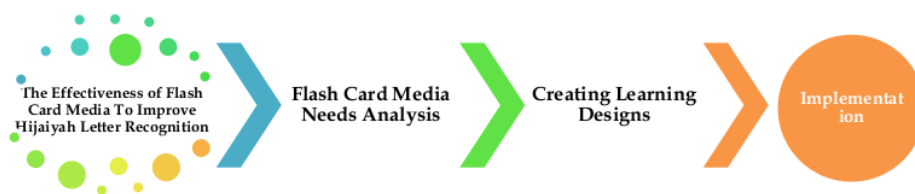
Figure 2: Flash Card Media Effectiveness Flow To Improve Hijaiyah AUD Letter Recognition