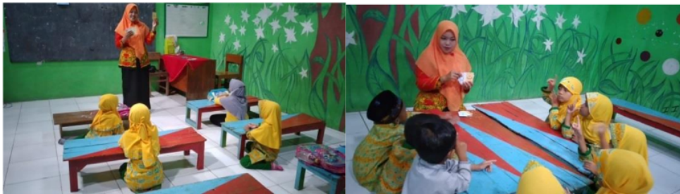
Figure 3: Activities using Flash Card media

After analyzing and designing learning, the implementation of flash card media to improve the introduction of hijaiyah letters early childhood. This medium facilitates its delivery so that children can quickly know and memorize it. According to UH, as a B class teacher at Raudlatul Athfal Al Hanafiah, Kotaanyar Probolinggo explained that flashcard methods could be developed according to the needs and creativity of learning in the classroom to create a pleasant learning atmosphere. The learning process using flash cards is illustrated with Figure 3.