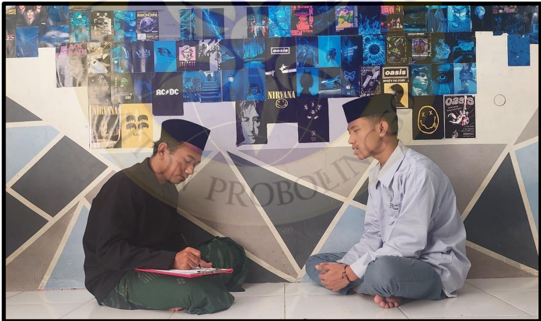
The Interview of the Eight Student (MHW), Conducted on June, 05 th 2024