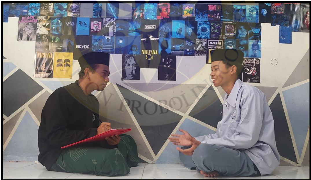
The Interview of the Fourth Student ( NHA ), Conducted on June, 05 th 2024