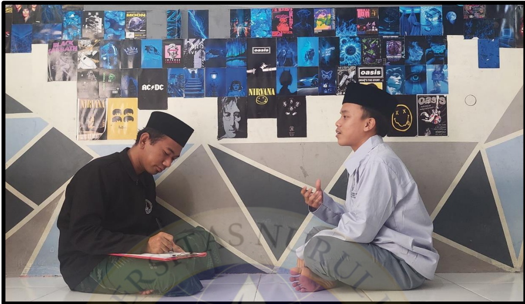
The Interview of the First Student (AFEA), Conducted on June, 05 th 2024