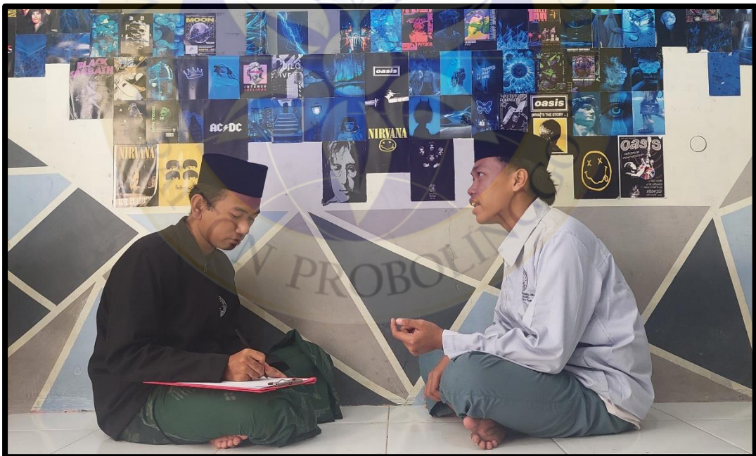
The Interview of the Sixth Student ( MD ), Conducted on June, 05 th 2024