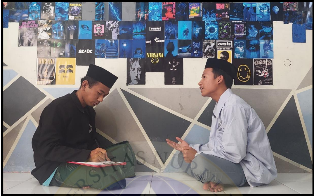
The Interview of the Seventh Student (NAE), Conducted on June, 05 th 2024