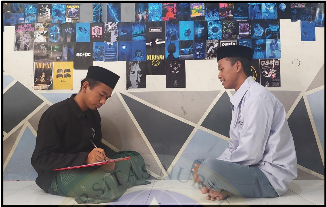
The Interview of the Fifth Student ( RAP ), Conducted on June, 05 th 2024