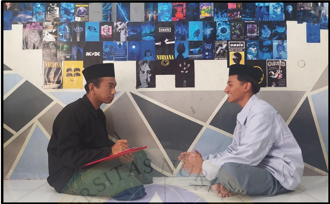
The Interview of the Third Student ( GFR ), Conducted on June, 05 th 2024