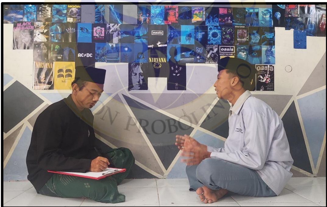
The Interview of the Second Student (SH), Conducted on June, 05 th 2024