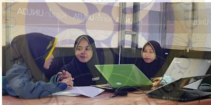
Picture 5.1 documentation of the interview