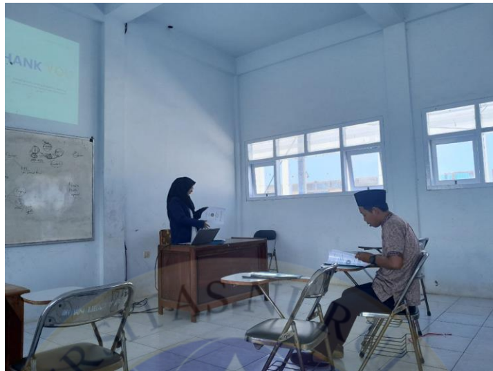
Picture 5.1 documentation of the proposal seminar