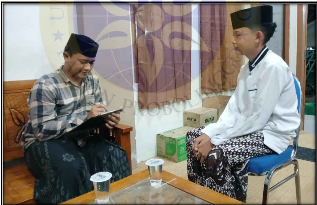
The interview of the Second Student (RM)