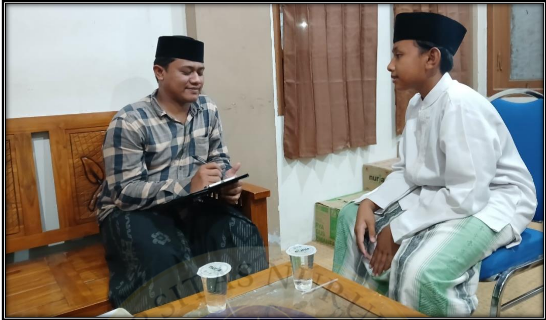
The interview of the Third Student (AK)