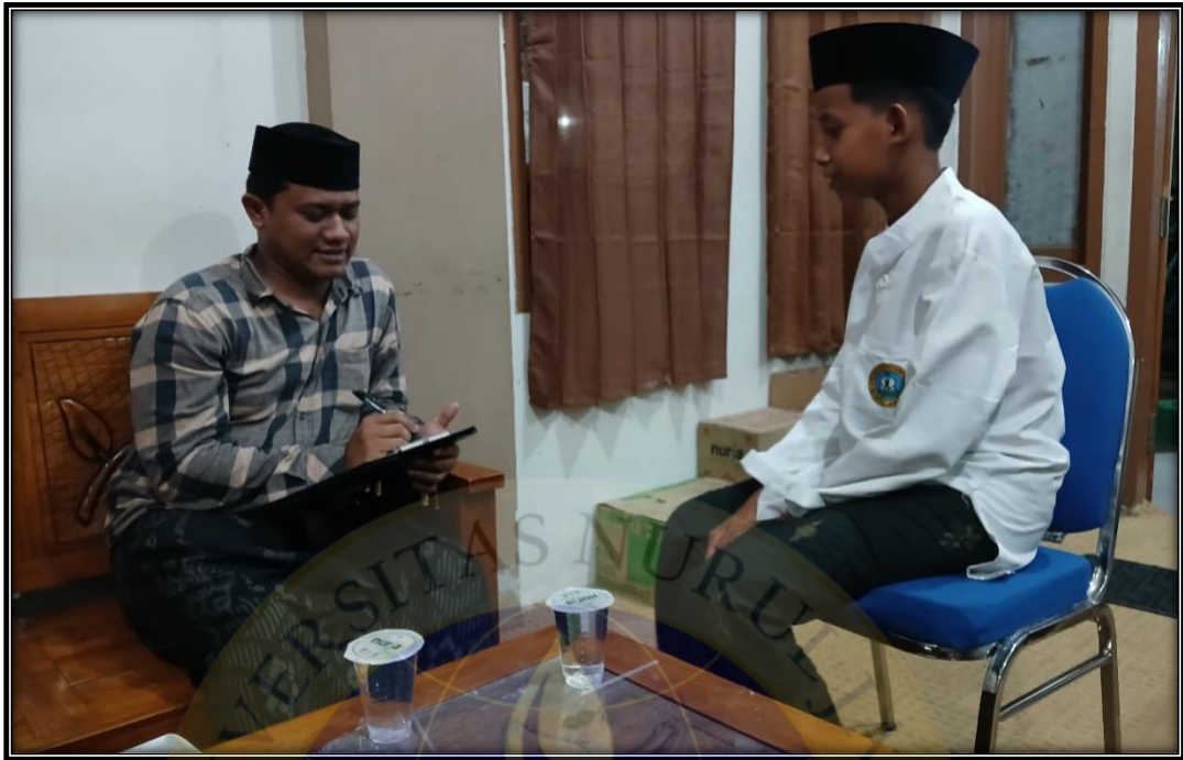
The interview of the First Student (MFA)