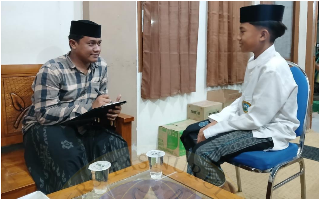
The interview of the Fifth Student (PAW)